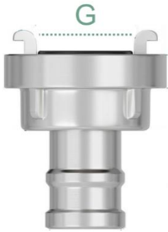
Storz hose link