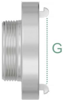
Storz male thread link