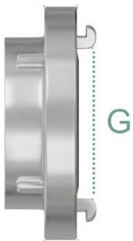
Storz female thread link