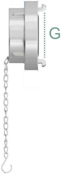
Storz link plug